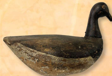
Early gunning brant. Maker unknown. Best Root Head Category.