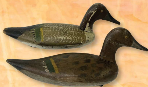
John Glenn pintail pair. Best Rock Hall Category.